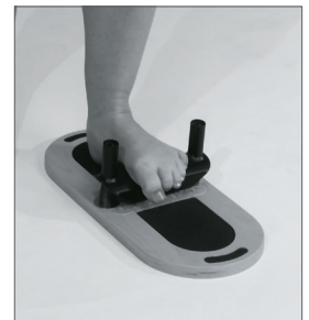
Figure 3. Starting Position