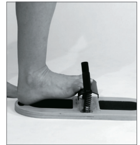
Figure 1. Starting Position

Be careful with these exercises if you have any foot conditions that are currently painful or inflamed. Be especially careful with plantar fasciitis, neuromas and after any kind of foot surgery. If you have any questions about performing these exercises, ask your doctor, podiatrist or other medical professional if they are appropriate for you.