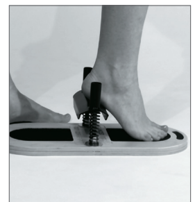
Figure 4. Starting Position